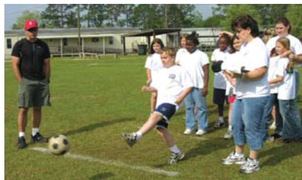
Figure 1.4 Although physical education has been the most widely used name for the field throughout history, this name may still be appropriate only for programs focusing on preparing teachers of physical education for the public school system.