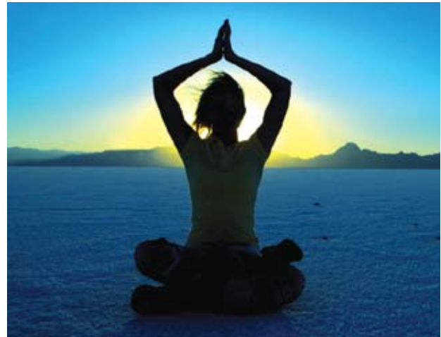
Figure 1.1 A main reason for the popularity of kinesiology is the increasing recognition of the importance of health-related and skill-related human movement.

One of the underlying reasons that the confusion about definitions and dimensions went on for so long is the extraordinary breadth and scope of academic approaches and professional purposes that