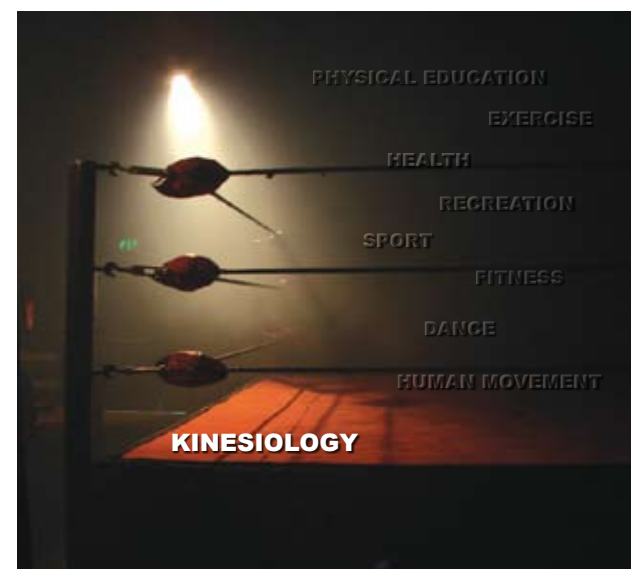
Figure 1.5 Of all the contenders in the name game, kinesiology has been thrust into the spotlight because it FITS.

Focus of Study Above all, the name of the department should evoke the focus of study of that unit. The word kinesiology does just that; its roots can be traced back to ancient Greek terminology to literally mean the study of ( logy ) human action ( kin ). Consequently, this title clearly presents the central topic of human movement and represents all of the facets of this focus through a nonspecific umbrella term that covers exercise, fitness, sport, health, leisure, recreation, and play in a way that