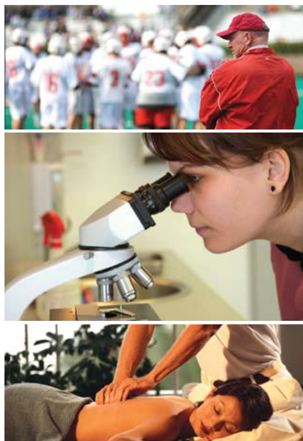
Figure 1.3 An ever-increasing number of students are choosing to pursue movement-related professions and health-related careers as the focus on health and wellness has grown.

of all ages, of every skill level, and in the full range of physical conditions are active in sports. Similarly, the focus on health and wellness, prevention of lifestyle diseases, and promotion of lifespan well-being has never been as pronounced or as widespread as today. The biophysical bases of our field, such as exercise physiology, biomechanics, and nutrition, attract many to kinesiology, as does the scope for sociocultural, behavioral, and philosophical analysis afforded by the full range of human movement action in society today. Consequently, kinesiology is becoming the choice of an ever-increasing cadre of students, who ultimately swell the ranks of such movement-related professions and health-related careers as teachers and coaches, researchers and professors, physicians and physical therapists (Figure 1.3; also see Chapter 13).