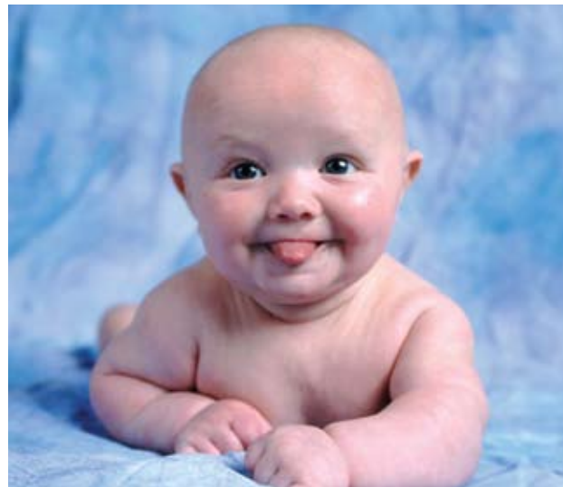
Figure 8.3 Infancy starts at birth and ends at age one.

The childhood period begins when an infant is 1 year old and lasts until age 13. During early childhood , which lasts until age 6, there is a gradual loss of baby fat. Girls lose less fat than boys, so in the first year after early childhood, girls tend to have more body fat than boys of similar age. Early childhood is a time of rapid growth, although the rate of growth is slower than it is during infancy.