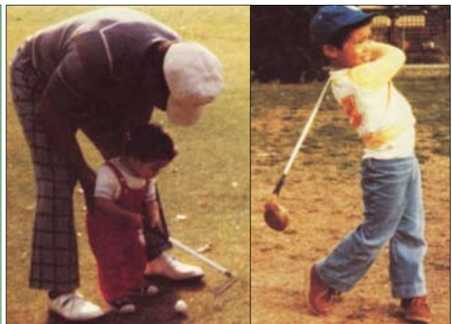
Figure 8.2 There are many well-known child prodigies who developed their skills very early in life.

From the start, Tiger Woods' life was dotted with feats of genius. At 10 months of age, having spent his infancy watching his dad hit golf balls in the family garage, Tiger picked up one of Earl's clubs and smacked a ball into the practice net left-handed. Father Earl taught one-year-old Tiger to putt; he won a putting contest at two; by three he had developed a fearsome swing; and by six Tiger was playing and beating 18-year-olds.