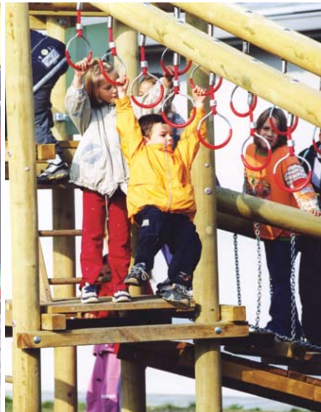
Figure 10.1 In order to attain a high level of achievement in physical activity and sport later in life, it is important to develop a vast repertoire of movement experiences early in life.