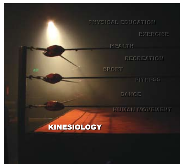
Figure 1.5 Of all the contenders in the name game, kinesiology has been thrust into the spotlight because it FITS.

Focus of Study Above all, the name of the department should evoke the focus of study of that unit. The word kinesiology does just that; its roots can be traced back to ancient Greek terminology to literally mean the study of ( logy ) human action ( kin ). Consequently, this title clearly presents the central topic of human movement and represents all of the facets of this focus through a nonspecific umbrella term that covers exercise, fitness, sport, health, leisure, recreation, and play in a way that