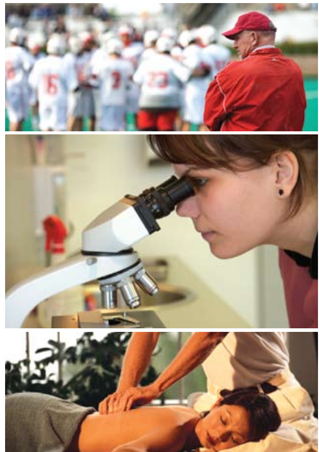
Figure 1.3 An ever-increasing number of students are choosing to pursue movement-related professions and health-related careers as the focus on health and wellness has grown.

of all ages, of every skill level, and in the full range of physical conditions are active in sports. Similarly, the focus on health and wellness, prevention of lifestyle diseases, and promotion of lifespan well-being has never been as pronounced or as widespread as today. The biophysical bases of our field, such as exercise physiology, biomechanics, and nutrition, attract many to kinesiology, as does the scope for sociocultural, behavioral, and philosophical analysis afforded by the full range of human movement action in society today. Consequently, kinesiology is becoming the choice of an ever-increasing cadre of students, who ultimately swell the ranks of such movement-related professions and health-related careers as teachers and coaches, researchers and professors, physicians and physical therapists (Figure 1.3; also see Chapter 23).