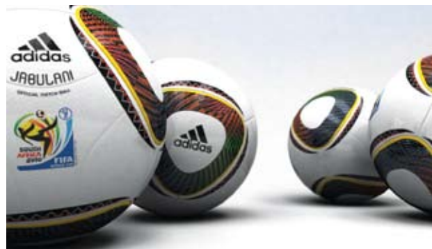
Figure 22.4 Advancements in soccer ball design have been made to increase the speed, accuracy, and range of the ball, but also to improve overall visibility.

Implement technologies include equipment that athletes use or that they kick, hurl, or otherwise propel. Other examples include football helmets equipped with warning devices and radios; “shark suits” that allow swimmers to more efficiently slice through the water; and high-tech running shoes, golf