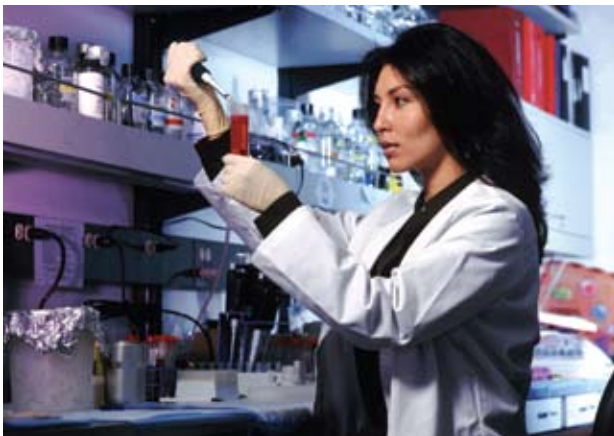
Figure 22.1 The irrefutable link between modern science and elite sport has changed the way athletes approach training and competition.

Over the last few centuries, North American societies have seen the mind and body as separate things, with the mind being viewed as more important than the body. This disconnect between the mind and body is termed mind–body dualism , and some argue that the influence of mind–body dualism remains strong in many aspects of Western society. As far back as late Greek culture, the notion that the mind was the boss of the body