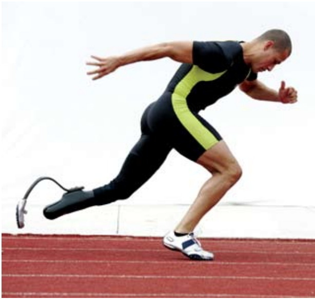
Figure 22.3 Athletes with prosthetic limbs can still perform and compete at a very high level.

helpful in obtaining a better perspective on the technological options that athletes will eventually have access to.