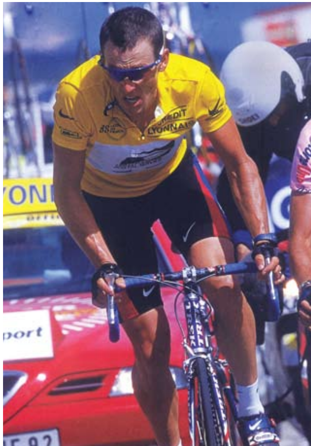
Figure 22.2 Lance Armstrong is a perfect example of a cyborg athlete.

Because athletes have become tied to various technologies, some argue that the 21st century is the era of the cyborg athlete. The term cyborg , short for cybernetic organism , was coined in 1960 by NASA scientists Manfred E. Clynes and Nathan S. Kline to describe the creation of an enhanced being capable of surviving in extraterrestrial environments. Far from the dramatic images of science fiction movies such as The Terminator , the first true cyborg was a simple white lab rat with a pump implanted into its body to release chemicals aimed at regulating physiological functions. This strange-looking creature, with